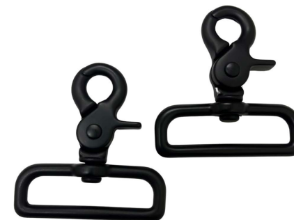
TRIGGER SNAP HOOK