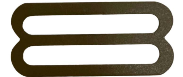
3 BAR SLIDE - 1 1/2" DRAWING NO. 2-6-1440