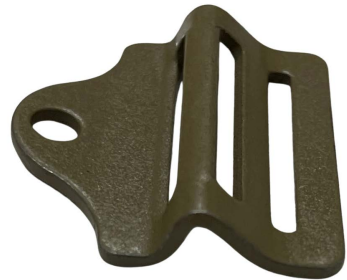
DB FRICTION BUCKLE