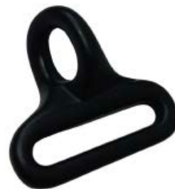
RIFLE LOOP ADAPTER