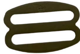
ROUNDED OVAL SLIDE 1"