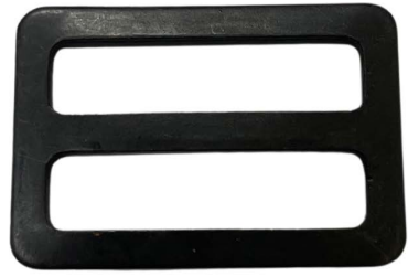
LARGE SQUARED SLIDE