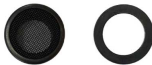
BONNIE HAT VENT AND WASHER 5/8" AND 3/4"