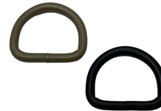
D-RING - .162 DIA WIRE

RN01193 - 3/4" RNDRW10 - 1" RN02427- 1 1/2"