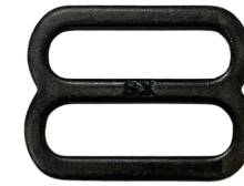
HEAVY DUTY SLIDE