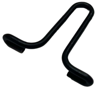
DUFFLE BAG KEEPER