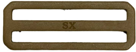
SQUARED OVAL SLIDE