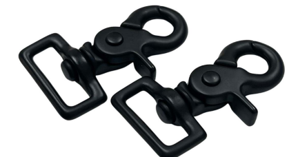
TRIGGER SNAP HOOK